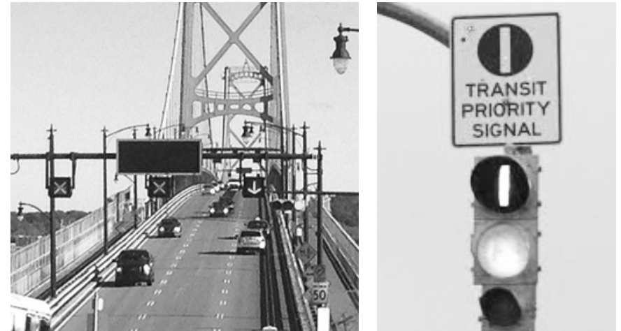
Traffic signals like on Macdonald Bridge reallocate existing road space.

There are proven, cheaper, quicker solutions.