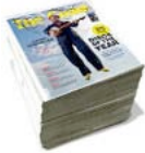
This week's cover